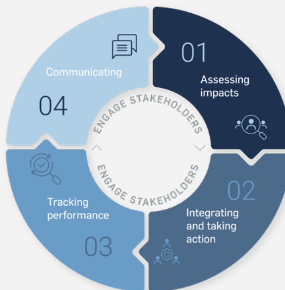
THE HUMAN RIGHTS DUE DILIGENCE PROCESS

According to the ILO Tripartite Declaration of Principles concerning Multinational Enterprises and Social Policy (MNE Declaration), the due diligence process, as it concerns workers' human rights, should “involve meaningful consultation with potentially affected groups and other relevant stakeholders including workers' organizations”. 21 According to the MNE Declaration, this process should “take account of the central role of freedom of association and collective bargaining as well as industrial relations and social dialogue as an ongoing process”. 22