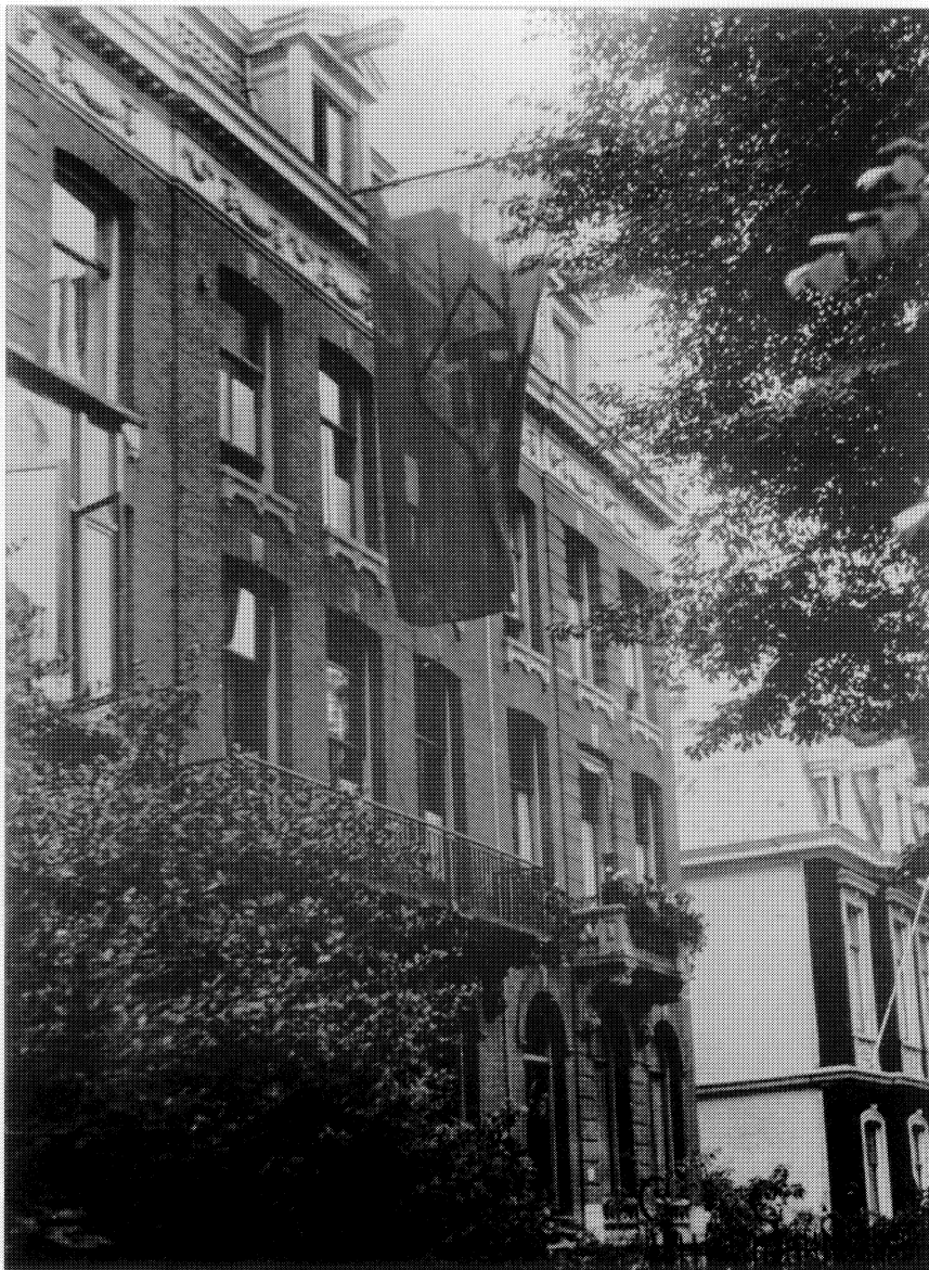
The ITF building in Vondelstraat, Amsterdam, which was the ITF headquarters from 1920 to 1939.